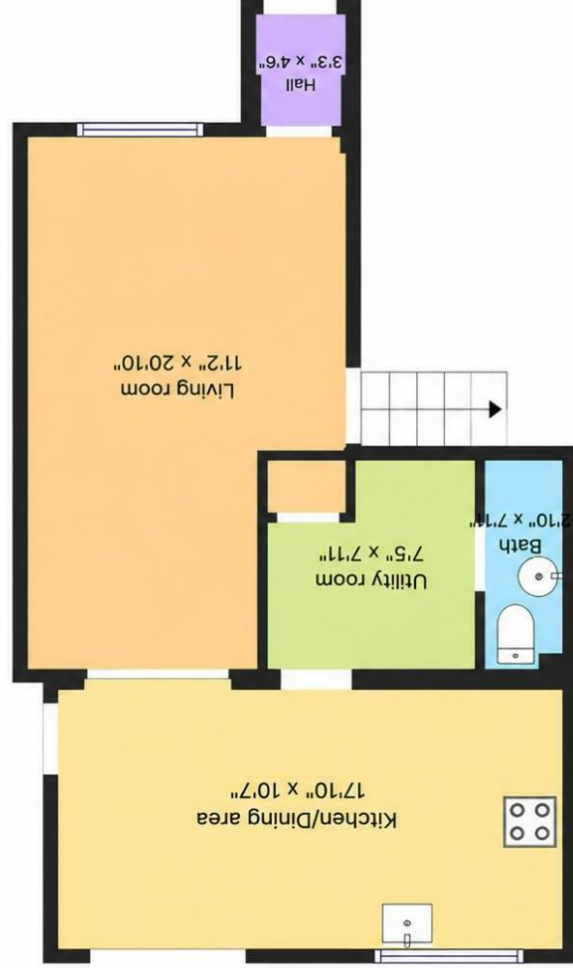
Sizes and dimensions are approximate, actual may vary.